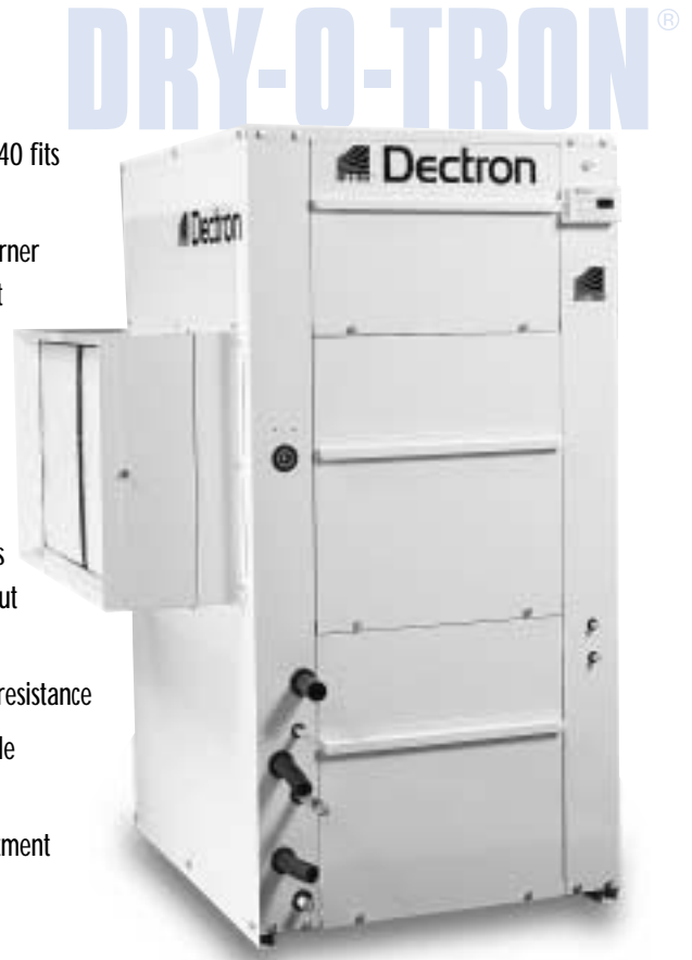
DSV Series (Vertical Air Flow, Corner Installation)