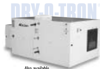
Also available DSV Series (Horizontal Air Flow)